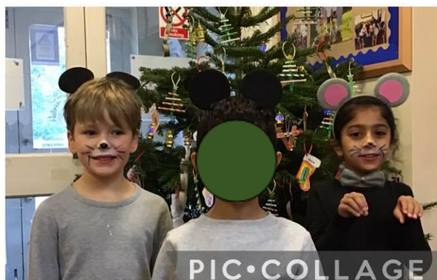
All ready for the performance!