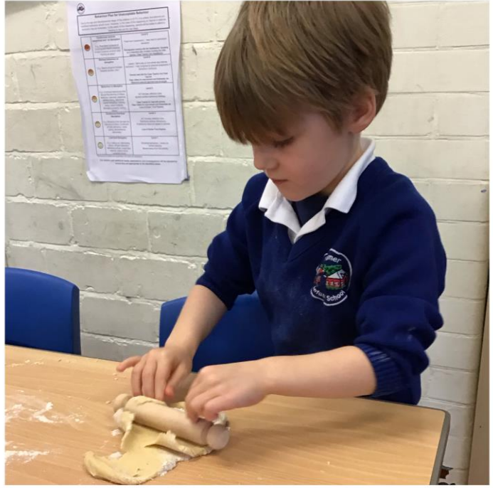
In DT we enjoyed following a recipe to make jam tarts.