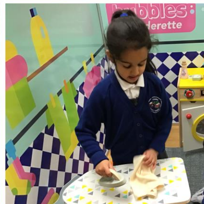
Year 1 enjoying Number Day and the Little City workshop