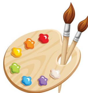
Year 2 creating their portraits in class