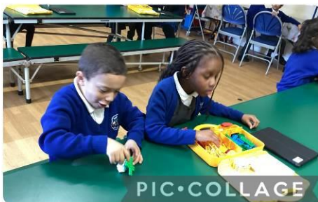
Reception Class getting to work on their robotic fairgrounds.