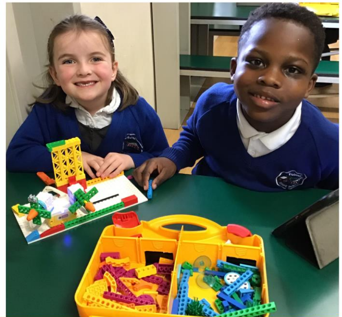
We had great fun constructing and coding lego robots!