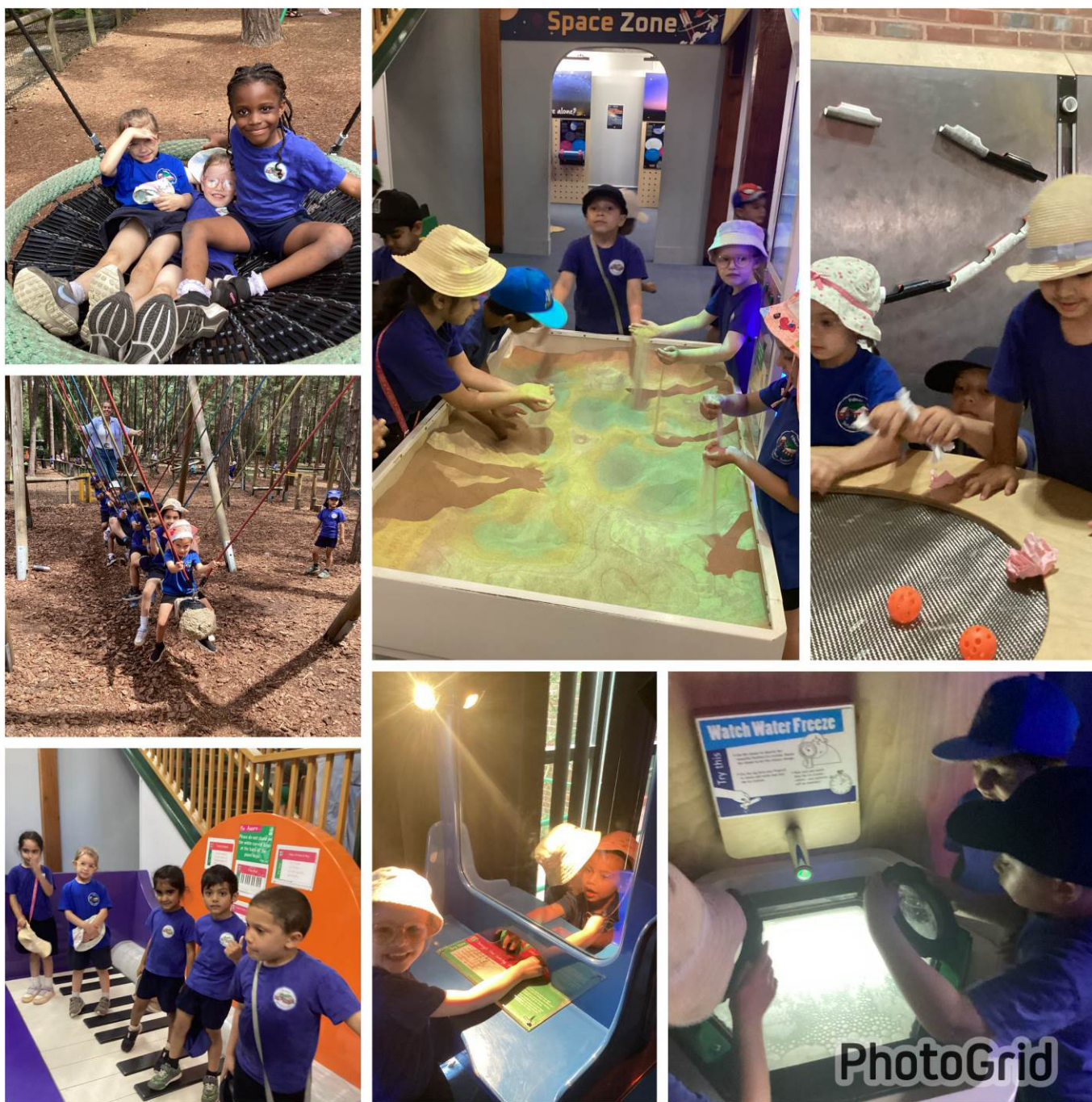
Reception had great fun at the Look Out Discovery Centre!