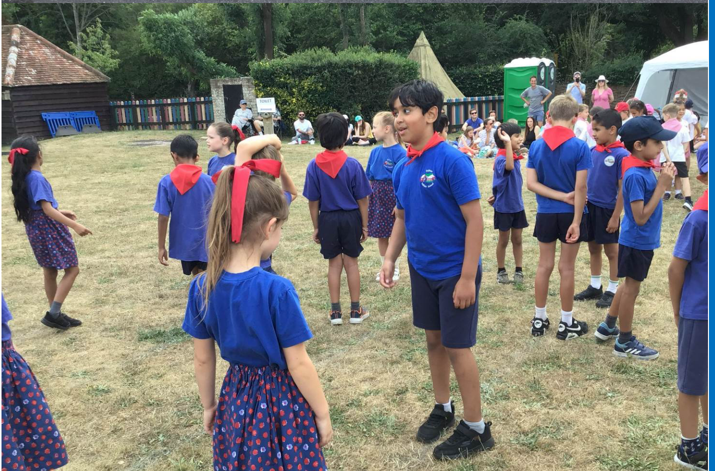
Having fun at country dancing!