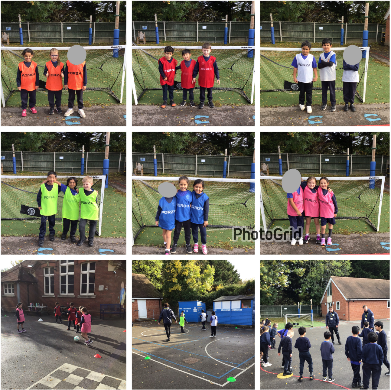
Year 2 enjoying their football sessions with AMA soccer last term.