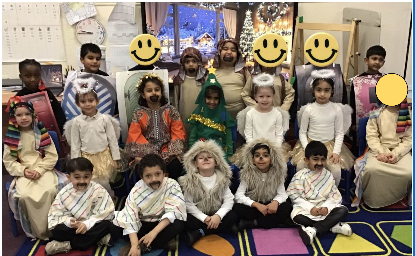
Year 1 are ready for the nativity!