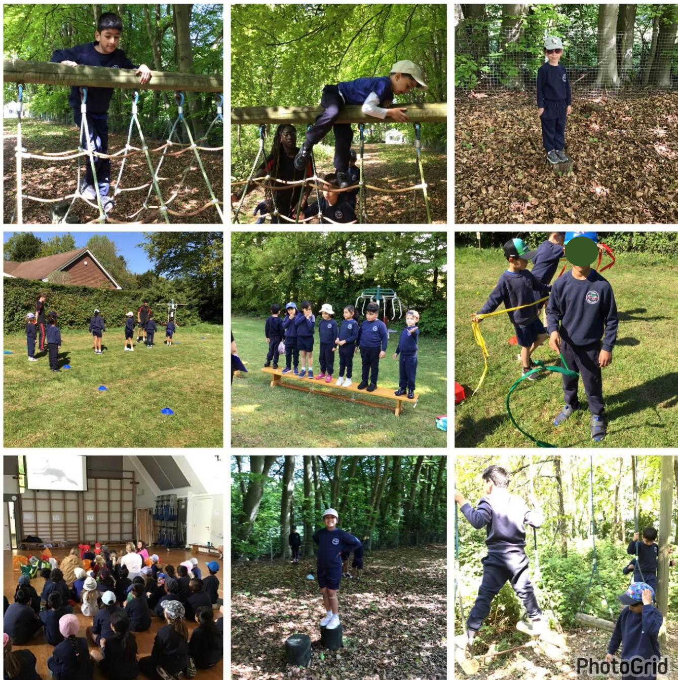
Year 1 and 2 taking part in the bear hunt activities at Alfriston School.