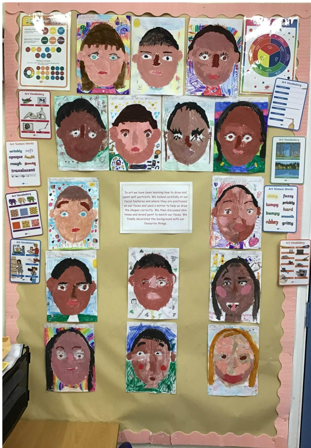
Year 2 have been working on self-portraits in Art.