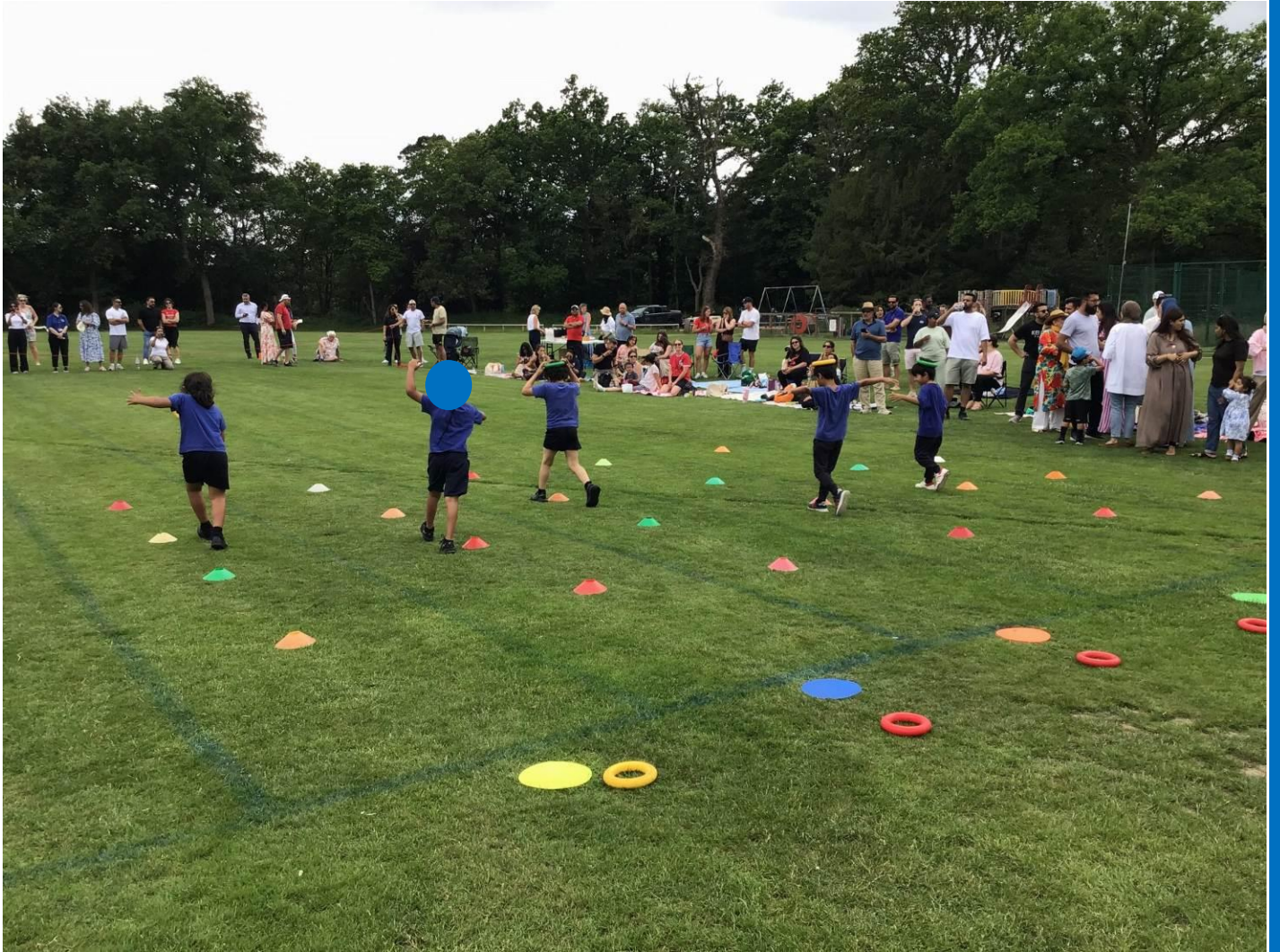
Year 1 enjoying the races at sports day.