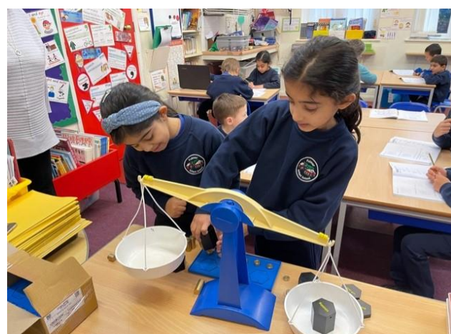
Busy Year 2 pupils have enjoyed some challenging tasks – Maths is always a popular subject! Year 1 pupils practice their cutting skills – such amazing concentration!