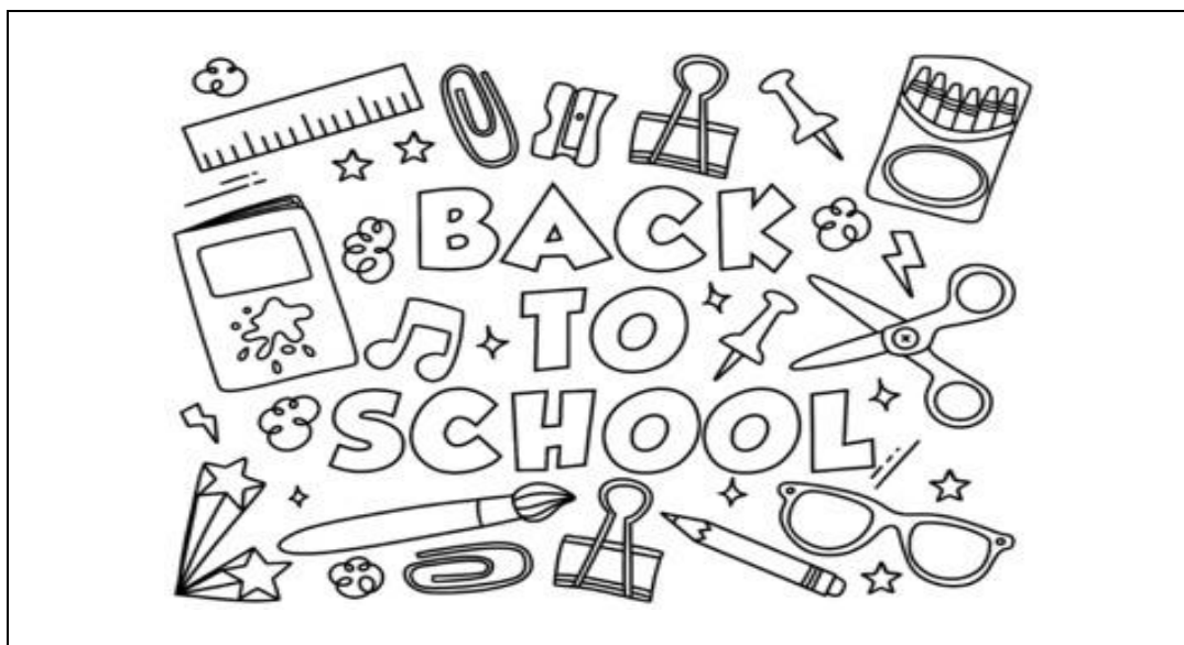
A Picture to Colour