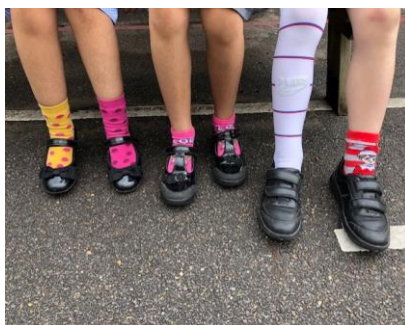
Year 1 socks