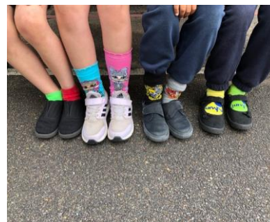
Year R socks