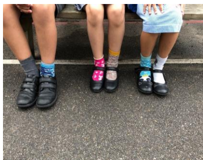
Year 2 socks

We had a wonderful array of socks worn into school this morning, and thanks for your very kind donations. We will advise the amount raised when all the money has been counted. This money will be forwarded onto the orphanage next week. Many thanks for your support and can you recognize the sock wearers?